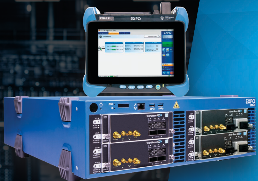
FTB-1 Pro and LTB-8 with the FTBx-88800 Series

It's perfectly suited for developers who need to validate interoperability and compliance with the latest 800G standards, such as those set by the Ethernet Technology Consortium (ETC).