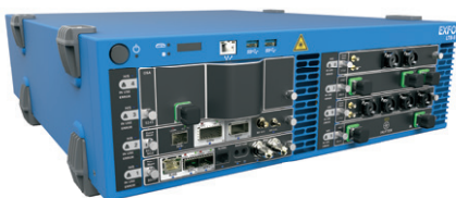
LTB-8 EIGHT-SLOT RACKMOUNT PLATFORM