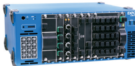
LTB-12 TWELVE-SLOT RACKMOUNT PLATFORM