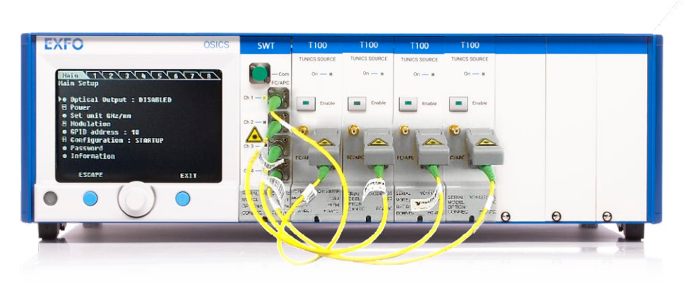
Figure 1. SWT in a full-band laser setup

This feature lets you activate each channel successively according to a preconfigured schedule.