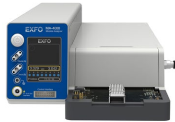
Minimized thermal chamber for industry's fastest thermal cycling