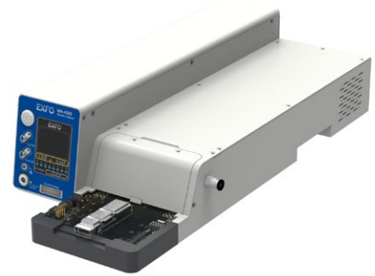
Easy-to-replace MCB in direct contact with BERT