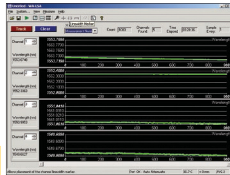
Trend analysis measures changes in wavelength over time.

To enable more detailed analysis, data collection by the WA-650 can be paused at any time to hold the most recently displayed spectrum. Or, the spectral data can be saved for future analysis. What's more, trends in laser spectral performance, such as frequency drift, can be analyzed over time with a real-time plot.